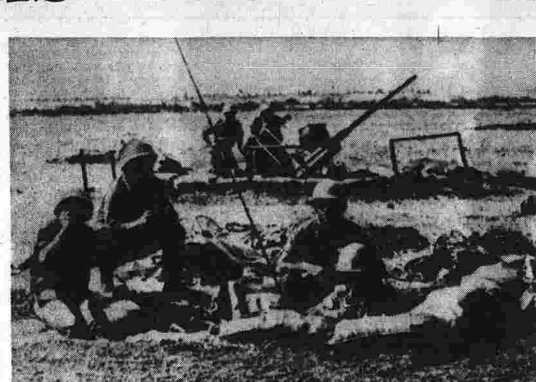
Israeli artillery positions are shown in Upper Galilee, Israel, where heavy fighting went on yesterday after the United Nations called for a cease-fire.

Lady Bird Is Flying High Lady Bird Johnson, on a weekend tour of New England states, rides the chair lift at Mt. Mansfield along with a secret service agent. On her agenda are a cranberry harvest in Maine, a ceremony at the restoration of Strawberry Bank, a New Hampshire colonial settlement and a salute to conservationists.