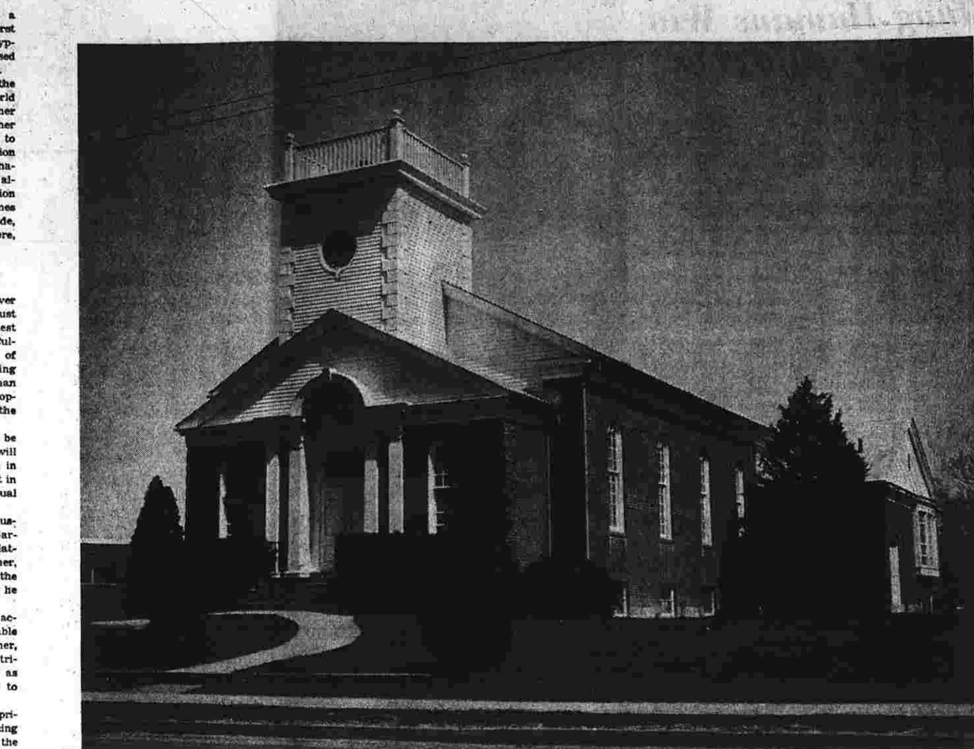
HOCKANUM METHODIST, MAIN STREET, EAST HARTFORD

Whatever the outcome of the immediate settlement between Arab and Israeli, whatever cease-fires or temporary arrangements are drafted in the United Nations, the settlement should be clear. This is that the world cannot countenance a return to the former status quo quo in the United Nations.